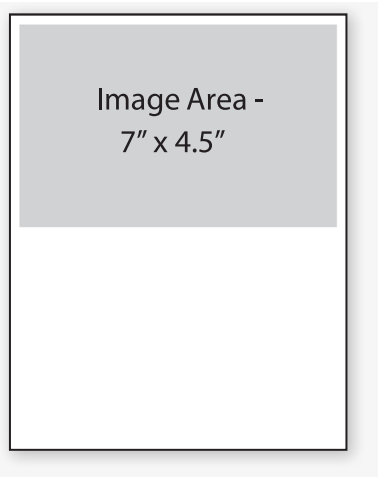
Half Page (H)