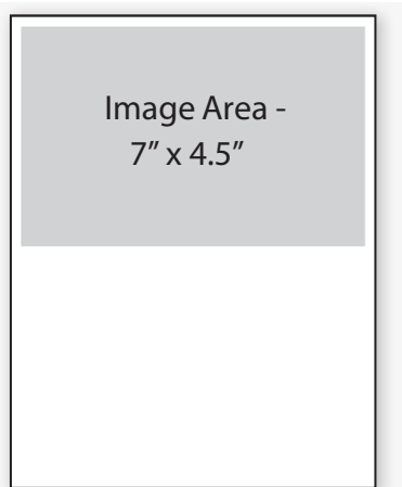
Half Page (H)